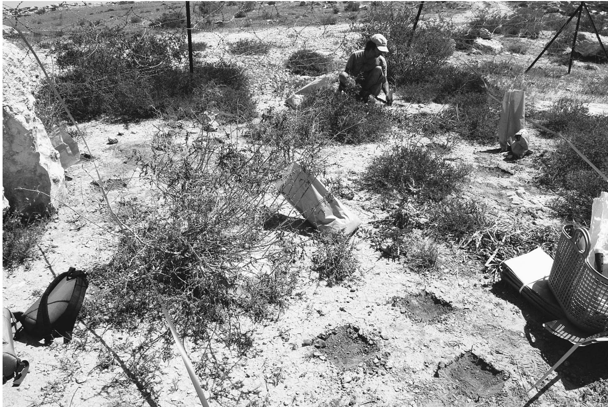
PLATE 1. Setting up of one of our blocks in the field at the semiarid site in Israel, July 2010. The plots (marked with tape on the corner) were excavated avoiding rocks and patches under shrubs. This part of the fieldwork was carried out during the dry season, when the winter annuals are stored as seeds in the seed bank and the landscape is dominated by small shrubs.

tion between soil origin and neighbors indicated a higher competitive release in Mediterranean soils. This effect, likely caused by the different initial density of the seed bank among soil origins (four times higher in Mediterranean soil; Appendix C: Table C1) might point at enhanced competition intensity in Mediterranean communities. Although this interpretation would be easier to verify when we had controlled for the density and identity of neighbors, we opted for using the natural seed bank rather than creating a standard artificial community in order to avoid potential bias to our results. Overall, our results might actually support our assumption about competition being more important in determining fitness under favorable conditions. This is in line with the assumption that environmental favorability and competition intensity are positively correlated (Grime 1977, Callaway et al. 2002, He et al. 2013).